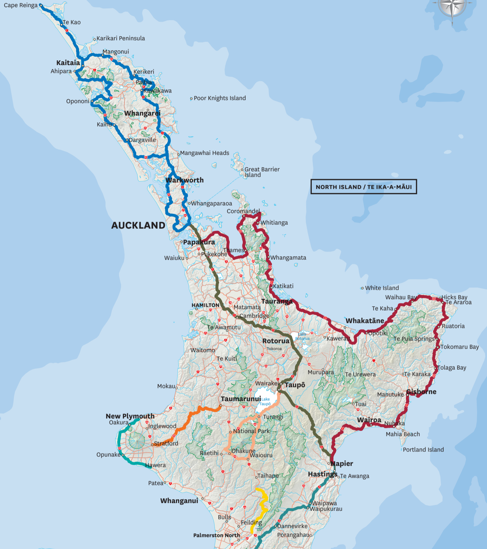
NORTH ISLAND / TE IKA-A-MĀUI